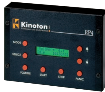
RP 4 Remote Panel