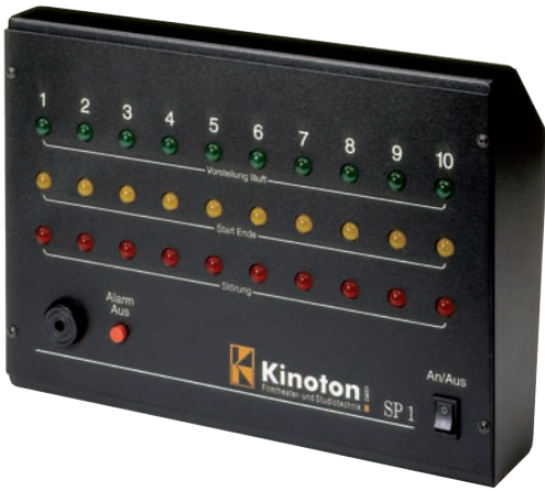
SP 10 Status Panel