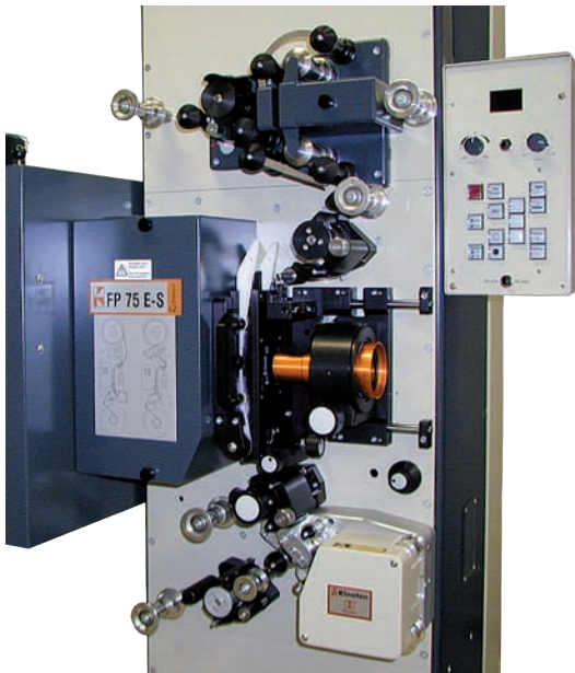
Film run mechanism