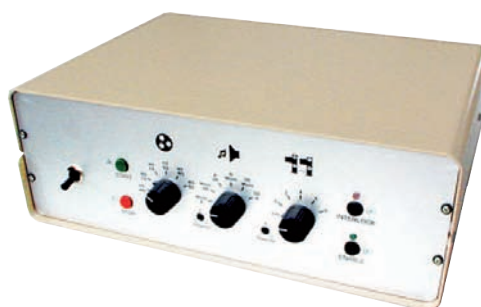
SA 2 in a wall mount case