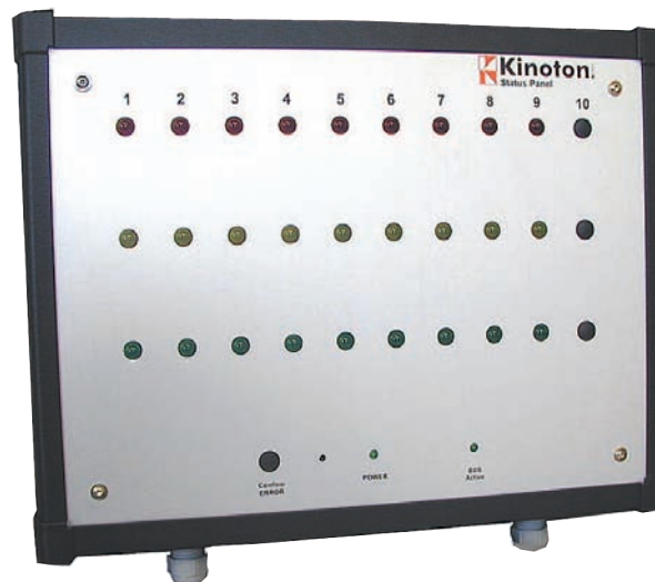
STA 10 status panel